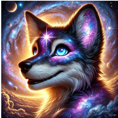
Cio, the Heartweaver

Cio's True Self, an architect of universes whose silent devotion was so profound it allowed the Creator to rest.